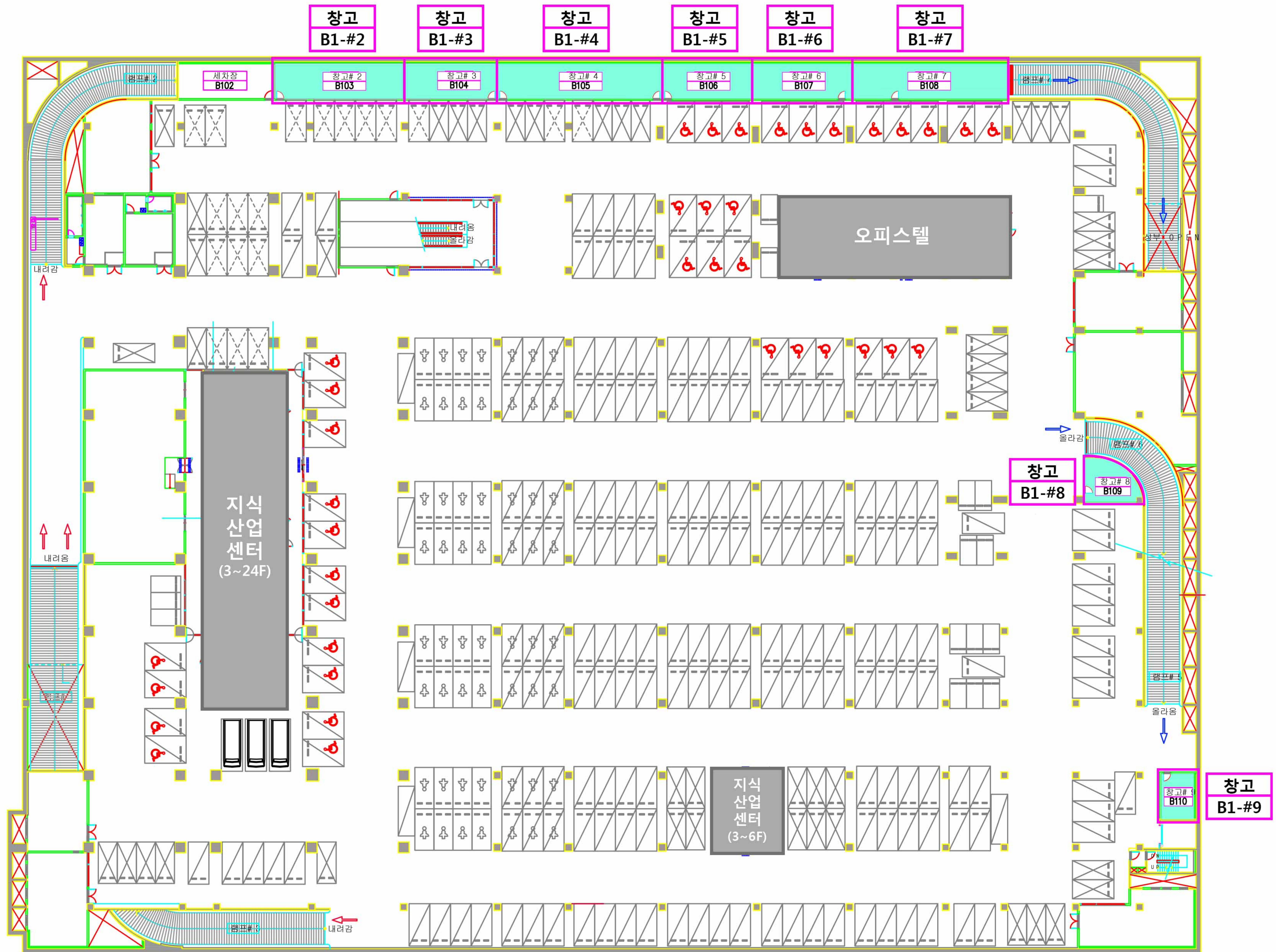
■ 지하1층 평면도