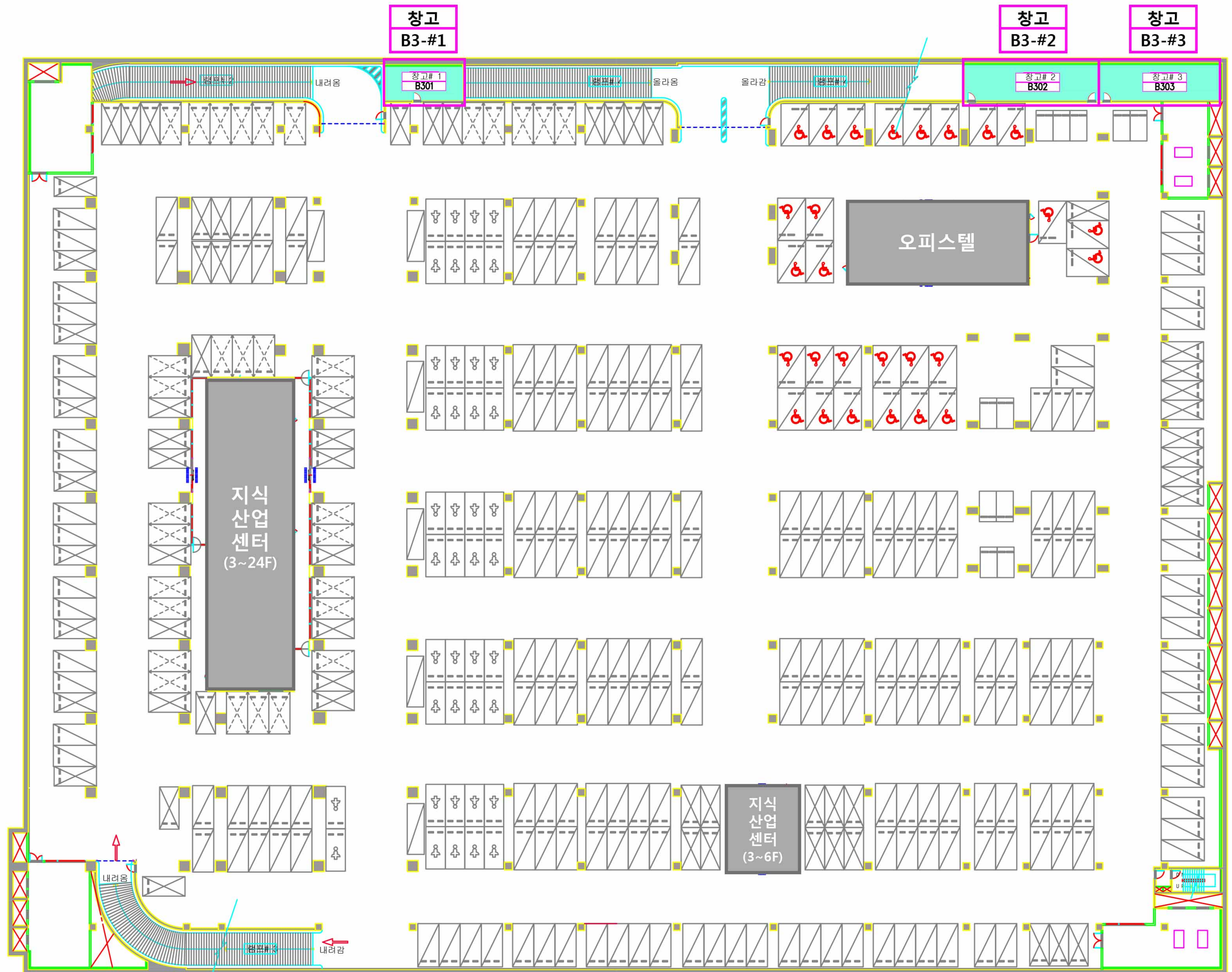
■ 지하3층 평면도